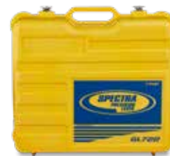
Rugged waterproof carrying case