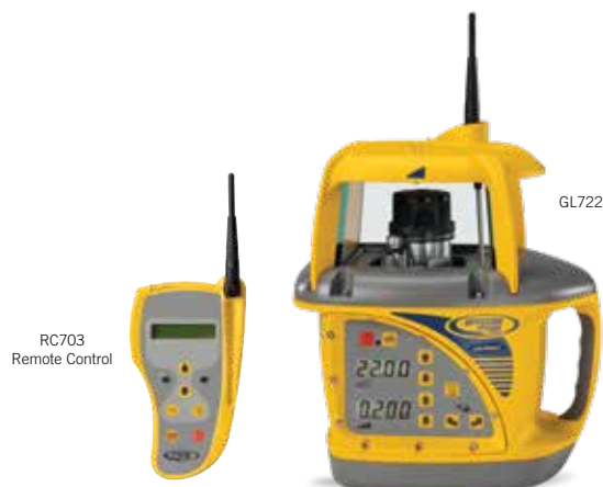
GL722 features long range radio remote control