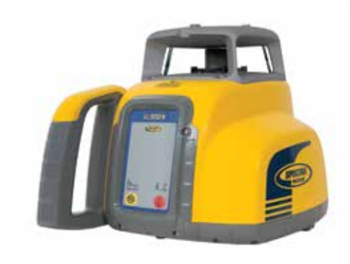
LL300N features a strong metal sunshade