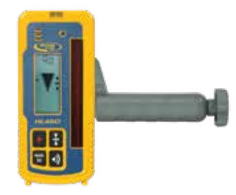
HL450 Receiver and C45 rod clamp included (Other configurations are also available.)